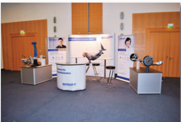
Premium: 5x3 meters