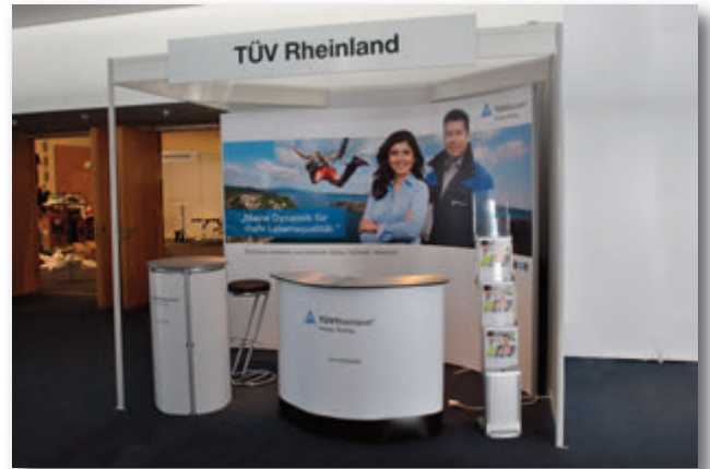
Standard: 3x2 meters