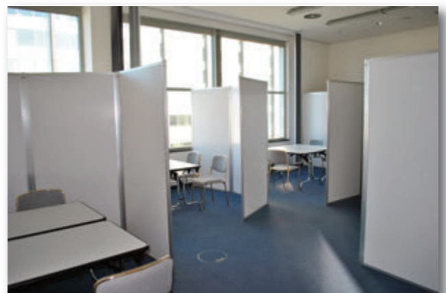
Interview room, part of Premium package or separately bookable