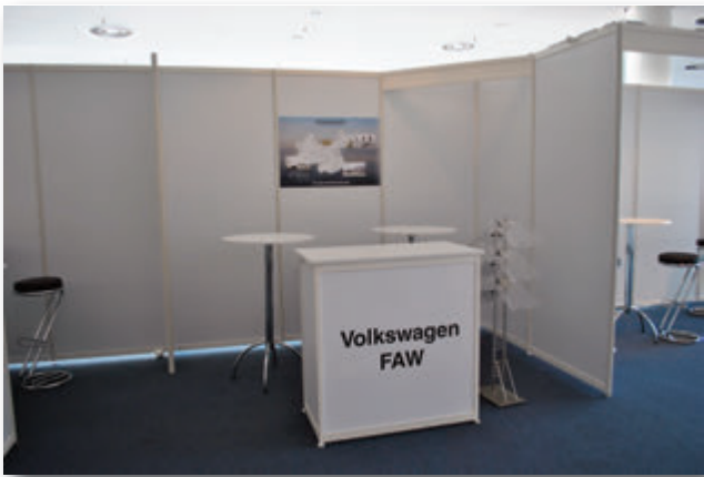
Standard: 3x2 meters