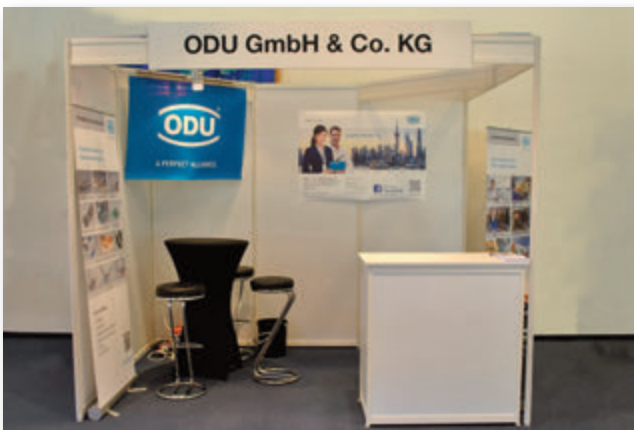
Standard: 3x2 meters