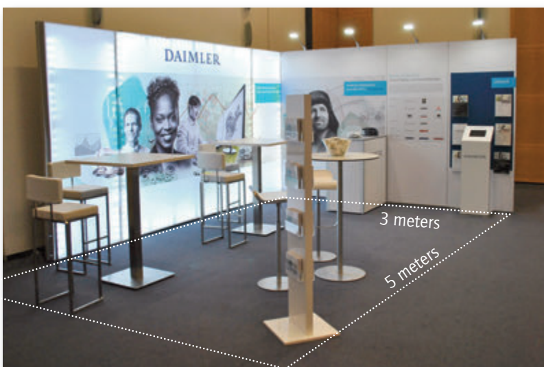
Premium: 5x3 meters

Bistro Tables | Bar Stools Standard Tables | Standard Chairs Info Counter | Brochure Stand