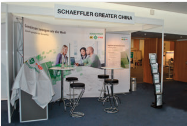
Standard Extended: 4x2 meters