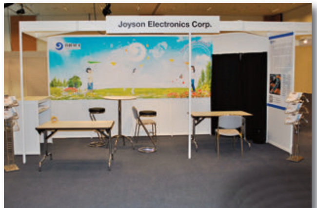
Standard Extended: 5x2 meters