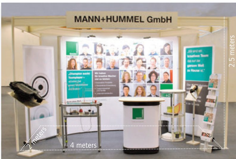
Standard Extended: 4x2 meters

Bistro Tables | Bar Stools Standard Tables | Standard Chairs Info Counter | Brochure Stand