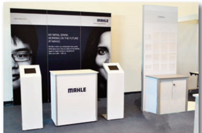
Standard Extended: 4x2 meters