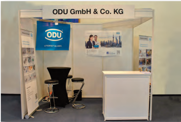
Standard: 3x2 meters