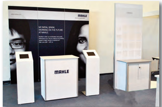
Standard Extended: 4x2 meters