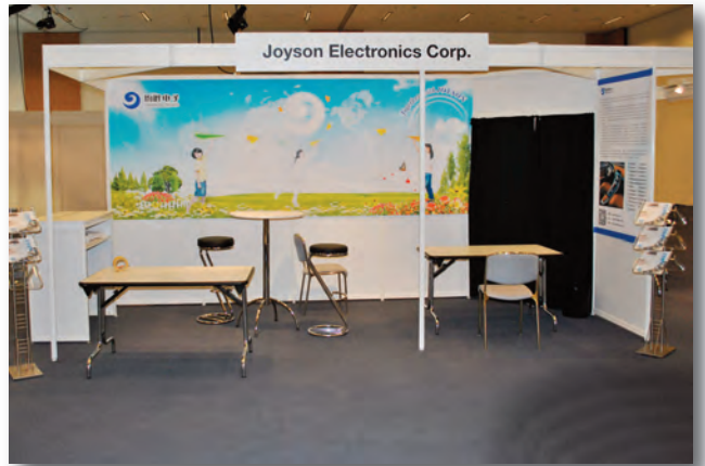
Standard Extended: 5x2 meters