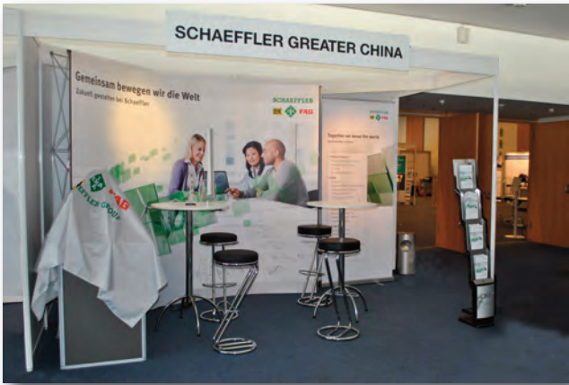
Standard Extended: 4x2 meters