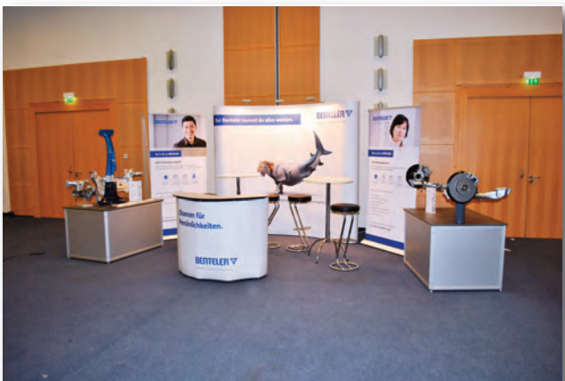
Premium: 5x3 meters