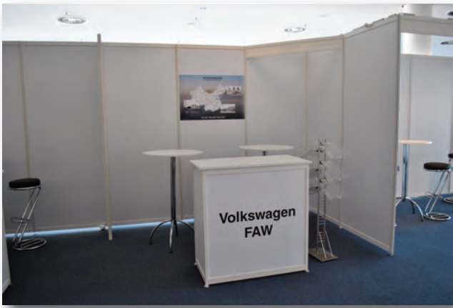
Standard: 3x2 meters