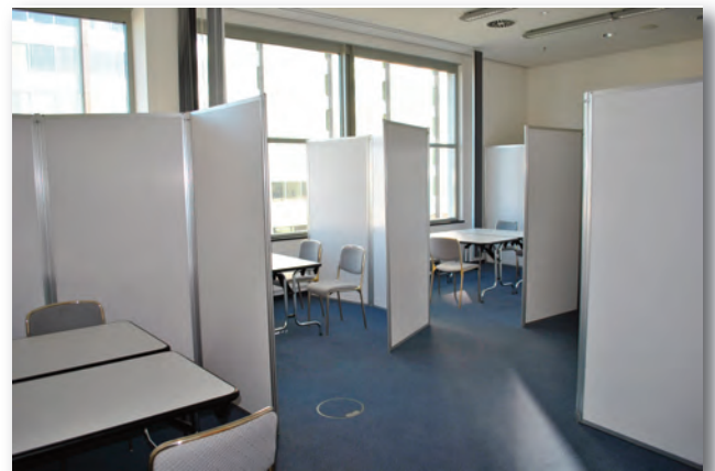
Interview room, part of Premium package or separately bookable