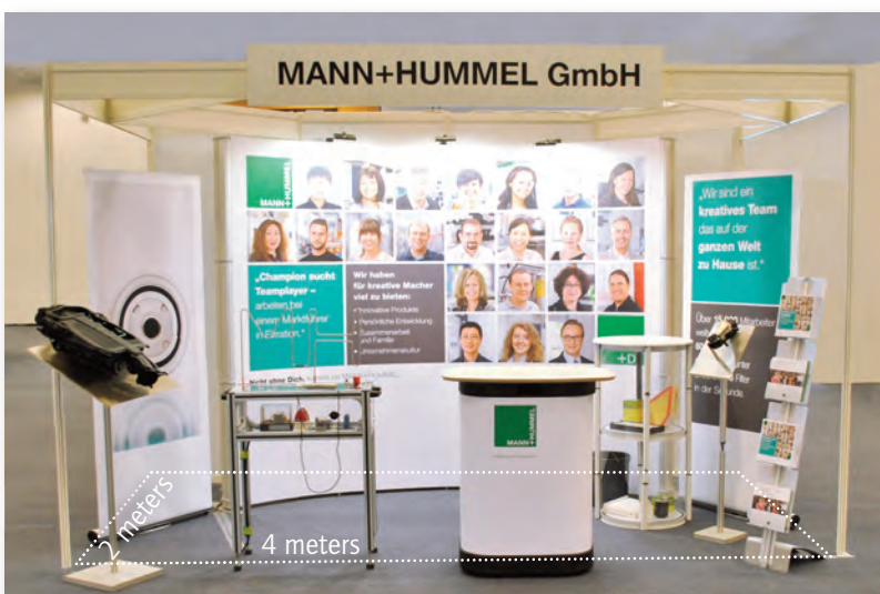
Standard Extended: 4x2 meters

Bistro Tables | Bar Stools Standard Tables | Standard Chairs Info Counter | Brochure Stand