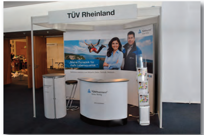
Standard: 3x2 meters